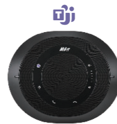
Microsoft Teams edition