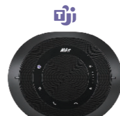
Microsoft Teams edition