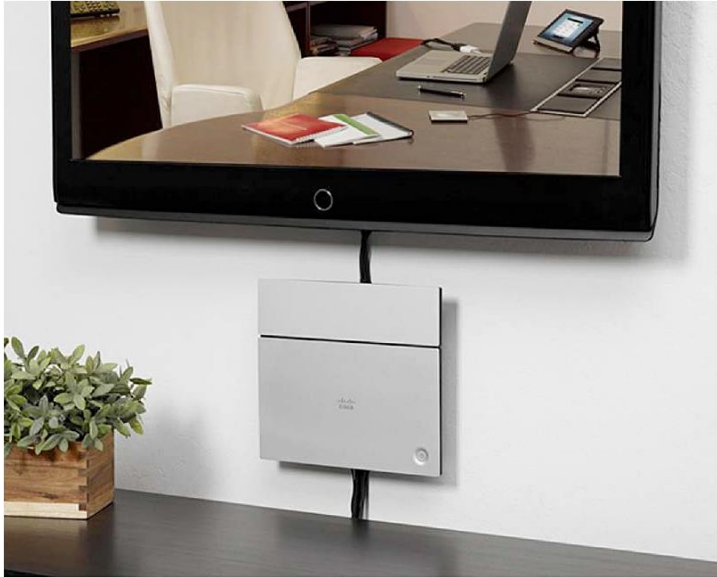
Figure 3. Cisco TelePresence SX20 Quick Set on Wall Mount