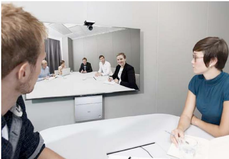
Figure 1. Cisco TelePresence SX20 Quick Set in a Small Meeting Room Environment

SX20 Quick Set combines a powerful codec, premium resolution of 1080p, three camera choices, and a dual-display feature in an easy-to-deploy and easy-to-use solution. Whether you're a small business just getting started with telepresence or a large enterprise looking to expand your existing deployment, the SX20 Quick Set delivers the performance you would expect from more expensive systems - in a compact, feature-rich and affordable package. Cisco TelePresence SX20 Quick Set is designed to truly extend the power of in-person to everyone, everywhere.