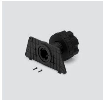
Control - DM 01