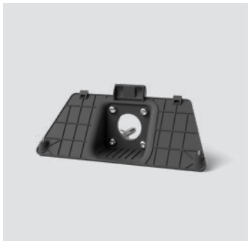
Control - WM 01