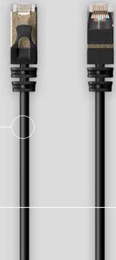
Power over Ethernet (PoE) cable