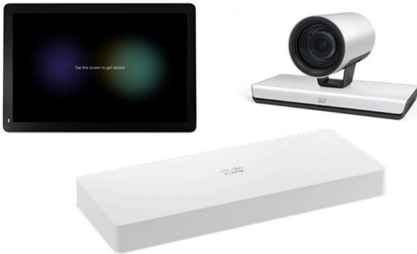
Figure 1. Cisco Webex Room Kit Plus Precision 60 integrator package

The Room Kit Plus P60 integrator package is rich in functionality and experience but is priced and designed to be easily scalable to all of your collaboration spaces – whether registered on the premises or to Cisco Webex in the cloud.