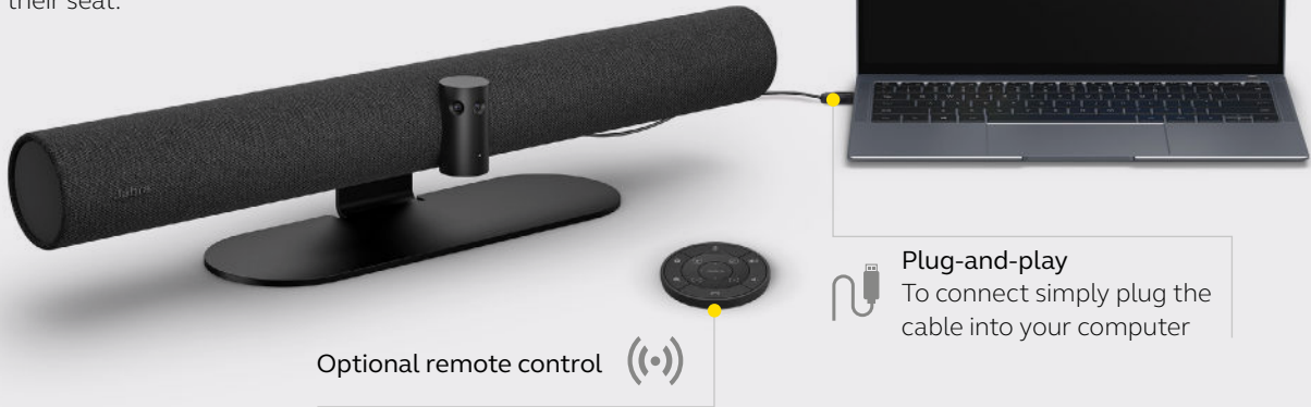
Optional remote control (📶)

PanaCast 50 is plug-and-play, so from the very first time you set it up, to its day-to-day use, it couldn't be easier to manage. Once it's up and running, your team can just walk into the room, plug the cable into their own laptop, and be sure that it will work with whatever platform they're using. There's also an optional remote control 3 , allowing them to operate the unit and interact with meetings without leaving their seat.