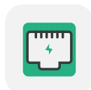
PoE or DC Power

Easy to mount with portrait or landscape.