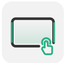
10.1-Inch Multi-Point Interactive Panel

Multi-Point touch capability screen to easily book rooms or check in/out at the RoomPanel Plus.