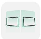
Various Mounting Methods

Environment self-adaptation. Automatically adjust the screen brightness and automatically wake up the screen.