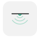
Actions with Occupancy Sensor *

Enhance ID authorization security and track meeting attendees.