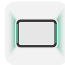
High Visibility LED Bars out Room Status

Enhanced face recognition security and check-in function.