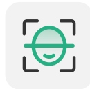
Face Recognition Camera *

Multi-Point touch capability screen to easily book rooms or check in/out at the RoomPanel Plus.