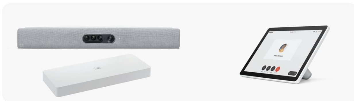
Figure 2. Default components of the Webex Room Kit Plus: Webex Codec Plus, Webex Quad Camera, Webex Room Navigator