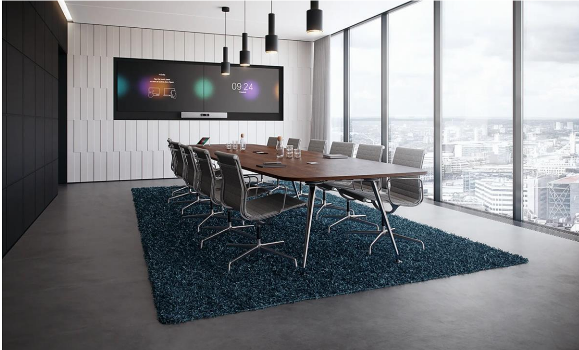
Figure 1. Webex Room Kit Plus in a conference room