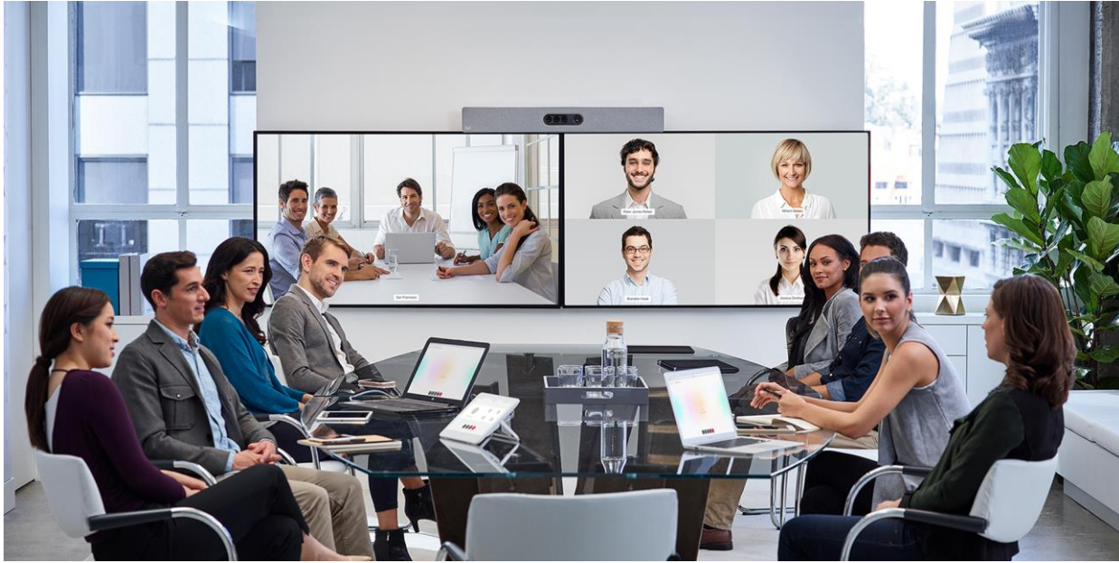
Figure 3. Webex Room Kit Plus in a large meeting room