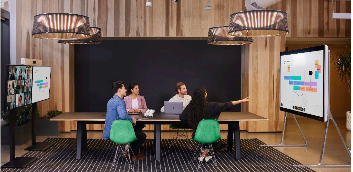
Figure 1. Webex Board 85 used for visual collaboration in a multi-screen environment