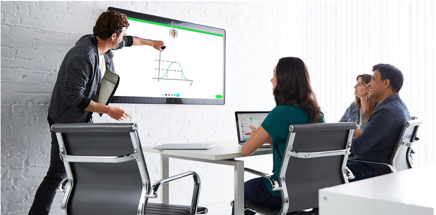
Figure 1. Whiteboarding capability on the Webex Board 55

The Webex® Board is an all-in-one device that provides everything you need to collaborate with your teams in physical meeting rooms. You can wirelessly present, white board, and have video and audio calls. And it securely connects to your virtual teams through the Webex service or via your Webex App-enabled devices, so you can take your meetings and content on the road. The Webex Board 55S* is designed for huddle and small spaces up to five people. The Webex Board is also available in 70- and 85-inch screen options.