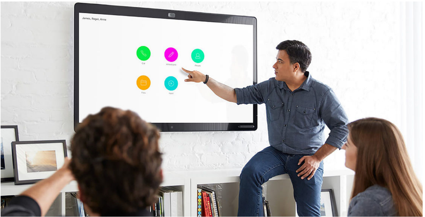
Figure 2. Meeting join on the Webex Board

The Webex Board 55S* is a fully self-contained system on a high-resolution 4K 55-inch LED screen. With an integrated 4K camera, embedded microphones, and a capacitive touch interface, the board brings intelligence, style, and usability to meeting rooms, from small to large. Designed with minimal wires for simplicity and elegance, Cisco's latest collaboration device allows