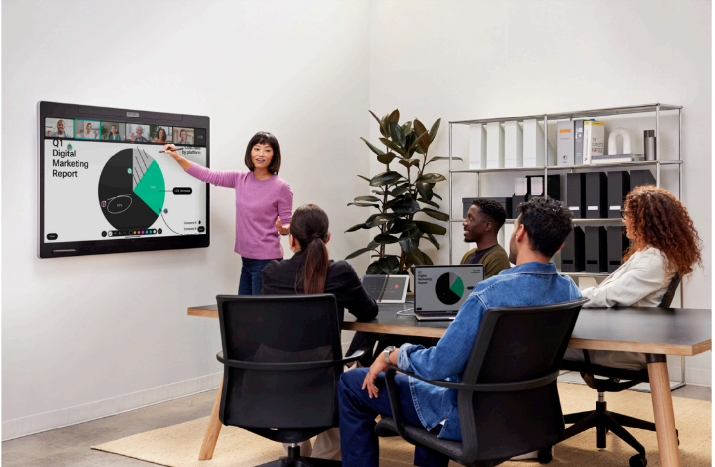
Figure 1. Content sharing in a video meeting using the wall-mount Board Pro 55