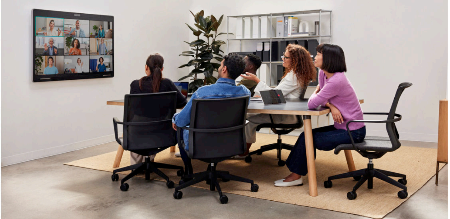
Figure 4. Video conferencing in a meeting room with the Cisco Board Pro 55