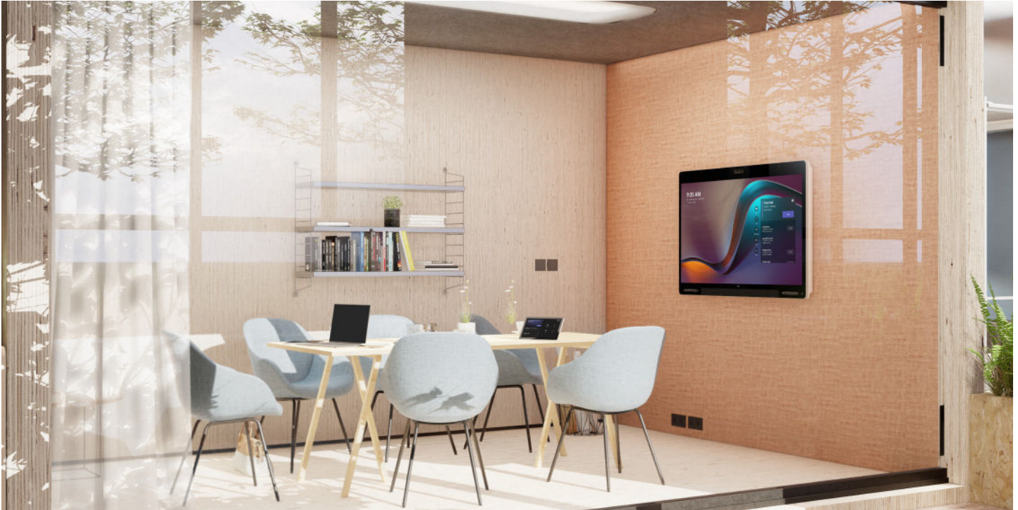
Figure 3. Cisco Board Pro deployed in a small meeting room, running the native Microsoft Teams Rooms experience