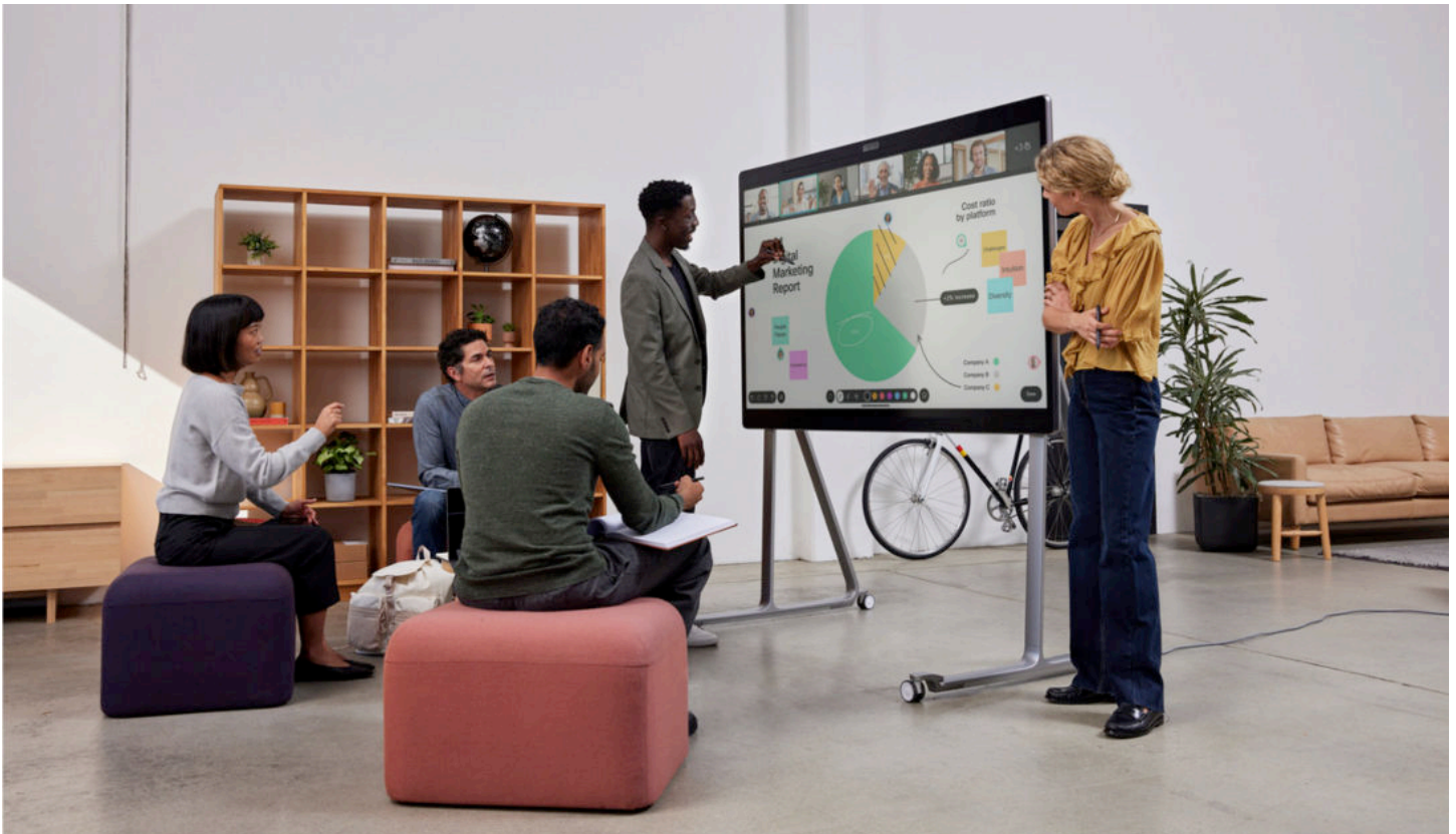
Figure 2. Digital whiteboarding session in an open studio using the Board Pro 75

Available in 55-inch and 75-inch models, the Cisco Board Pro helps your teams collaborate in a variety of meeting spaces and connect with remote members to become more productive. Board Pro draws its power from the RoomOS platform for the native Webex experience and video interoperability, while also provides the flexibility to run the device on Microsoft Teams Rooms.