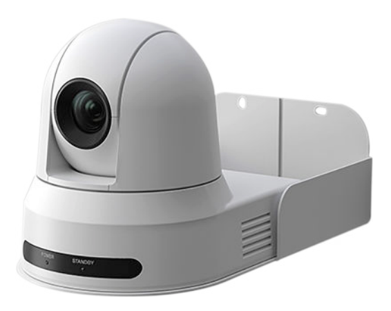
Figure 1. Webex PTZ 4K Camera