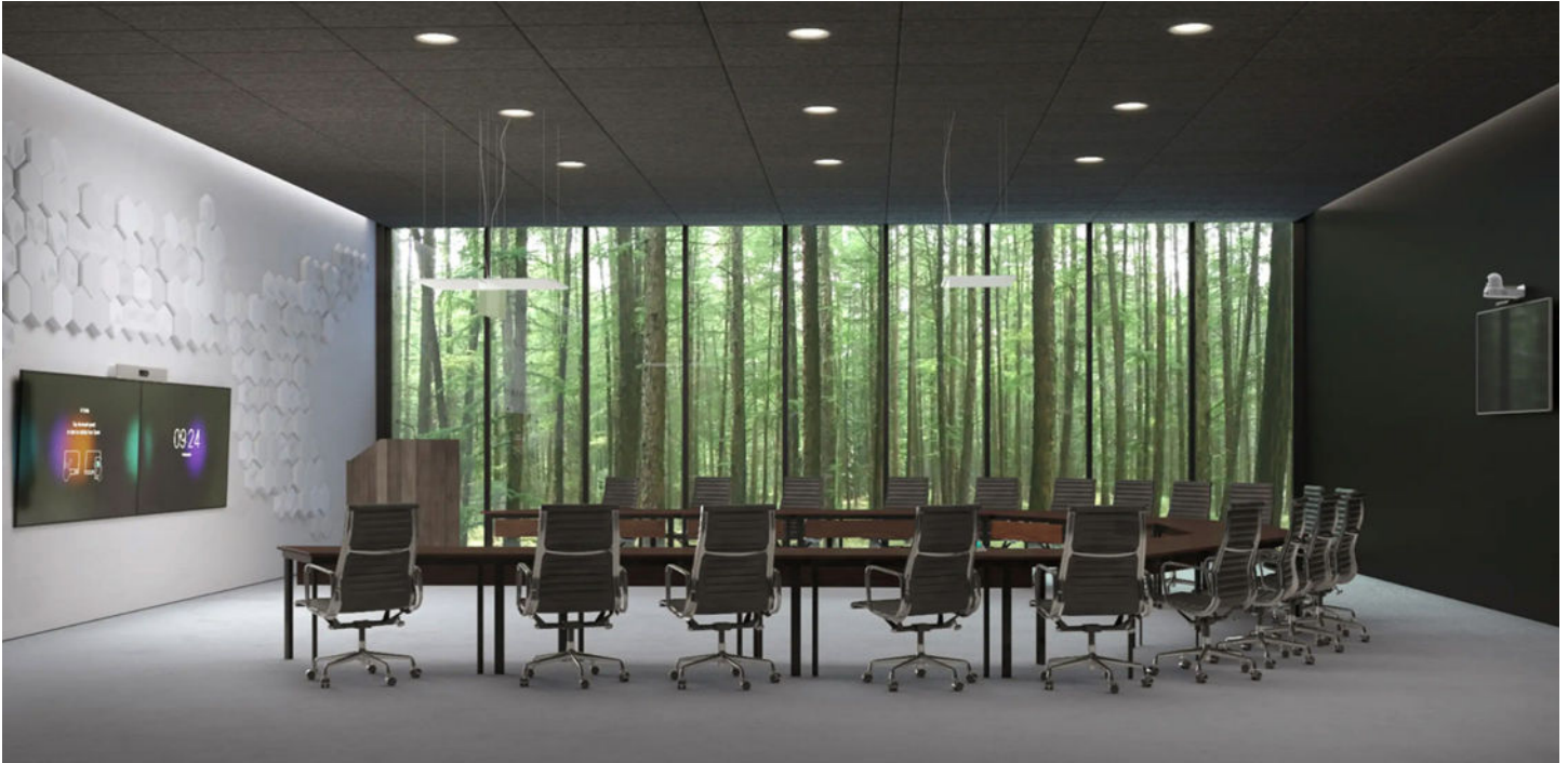
Figure 1. Webex Room Kit Plus PTZ 4K bundle with an additional Webex Quad Camera unit in a large conference room

The Webex® Room Kit Plus PTZ 4K Integrator Bundle is a powerful collaboration solution that integrates with up to two flat-panel displays to bring more intelligence and versatility to your collaboration spaces. This package combines the performance of the Webex Codec Pro collaboration engine, the flexibility of the Webex PTZ 4K pan-tilt-zoom camera and the purpose-built Webex Room Navigator table stand control panel to offer maximum flexibility and premium video collaboration in scenarios where you need special camera placement, want to view objects close up, or view a wide area with pan-tilt-zoom capability.