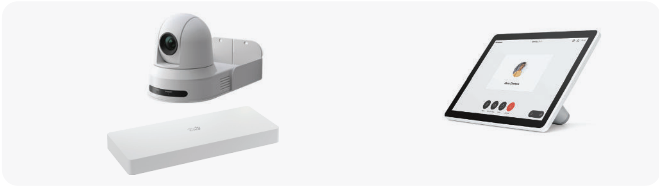
Figure 2. Default components of the Webex Room Kit Plus PTZ 4K bundle