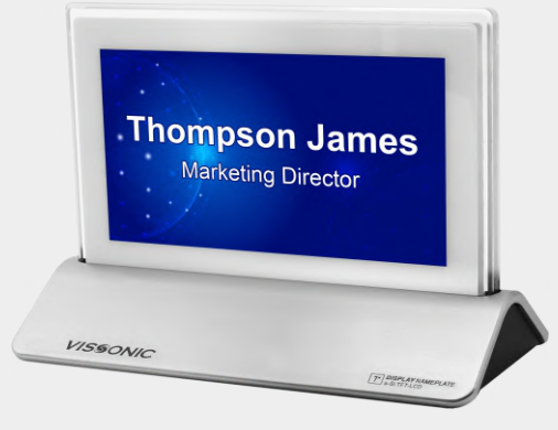
VIS-NP7 7" conference name plate

The 7" name plate adopts a 1024x600 screen, an integrally formed all-aluminum base, and a transparent highgrade plexiglass frame to create such elegant interface. It's a perfect device to modern meeting room integrate with conference system.