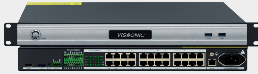
VIS-NCU1000 Control unit with web interface