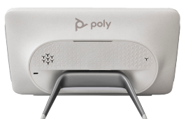
Poly TC10 White Touch Controller

The Poly TC10 touch control panel makes meetings more productive and allows users to easily schedule workspaces and conference rooms.