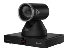
Poly Studio E60 Smart Camera 4K MPTZ with 12x Optical Zoom

Keep presentations engaging with the Poly Studio E60 smart MPTZ optical zoom camera. The main presenter is always in frame, and every person in the room is shown with exceptional accuracy, even at the far end. With every detail captured, presentations are easier to follow.