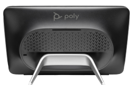
Poly TC10 Touch Controller Black

The Poly TC10 touch control panel makes meetings more productive and allows users to easily schedule workspaces and conference rooms.