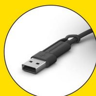
USB C and USB A connectors included