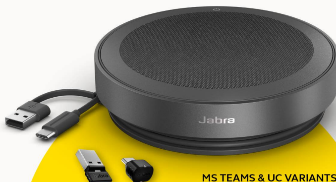
MS TEAMS & UC VARIANTS

To help consider our planet, we consider sustainability carefully at every stage of product development. The casing of Speak2 75 is made with over 33% sustainable materials 3 , and has a number of built-in parts that can be repaired or replaced. Better sustainability = longer speaker life = great calls for you and your team for years to come.