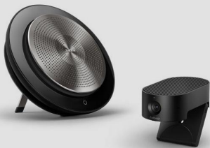
Jabra Speak 750 and PanaCast 20 Perfect for your home office

For amazing audio, choose from the extensive range of Jabra headphones and speakerphones.