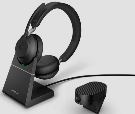
Jabra Evolve2 65 and PanaCast 20 Ideal for flexible collaboration