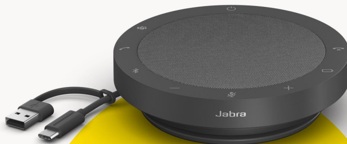
MS TEAMS & UC VARIANTS

We consider sustainability carefully at every stage of product development. The casing of Speak2 55 is made with over 50% sustainable materials**, and has a number of built-in parts that can be repaired or replaced. Better sustainability = longer speaker life = great calls for you and your team for years to come.