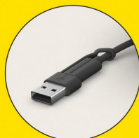
USB C and USB A connectors included